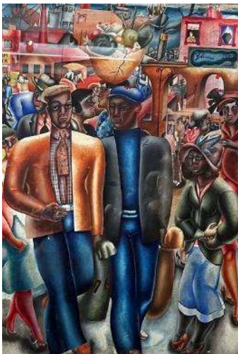
Market Day 1926

The show focussed on Burra's work during the 1920s and 30s, and he is renowned for his vibrant, satirical scenes of the urban underworld and his depiction of society and culture abroad. His practice is influenced by everything from music and performance to popular culture, literature, and art history. Burra was disabled by rheumatoid arthritis from childhood but regarded art as 'a kind of drug' that helped relieve the pain. After art school, he travelled to France with friends, visiting popular cultural entertainments such as bars, cafes and music halls. His paintings captured the energy of the 'roaring twenties', and the period of social and cultural liberation. Burra drew inspiration from French literature, cinema and music, and depicted characters from the seamier side of life that he witnessed around him.