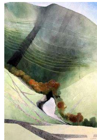
Valley and River Northumberland

Later Burra responded to contemporary events throughout WW2 but became depressed and despondent by the brutality and because he was not able to travel. He started to make money from his art in the 1950s but became increasingly isolated. In the 60s and 70s he was drawn to creating landscape paintings, when he travelled around the countryside with his sister due to his increasing frailty. He died in 1976 after a fall.