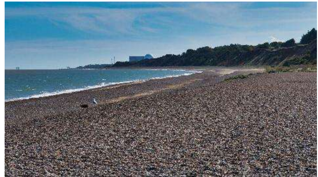
Dunwich Beach towards Sizewell

After lunch we travelled to Southwold, passing the lovely village of Thorpeness and the 'House in the Clouds,' a converted water tower. It looked like something from a children's' book.