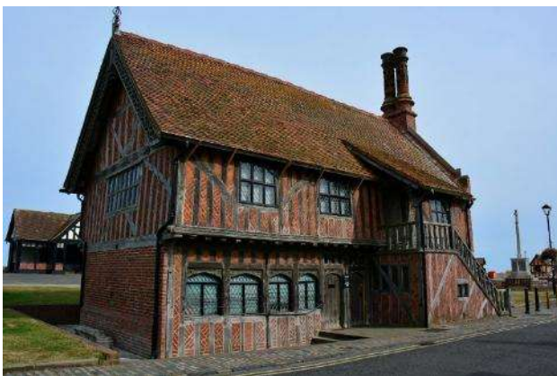
Tudor Moot Hall

Passing Maggie Hamlin's controversial scallop shell on the beach, loved and hated in equal measure, we also saw the Snape Malting and the churchyard where Benjamin Britten is buried.