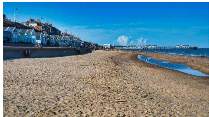
Southwold towards the pier

Southwold is full of charm with its pebbly beach and rainbow coloured beach huts along a lovely promenade, with plenty of seats to sit and look at the wide sea view. The short original pier was full of Edwardian character with its innovative water clock and collection of weird and wonderful automation.