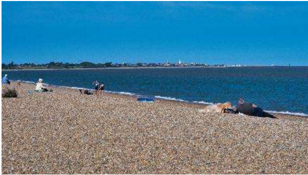
Dunwich Beach towards Southwold

We drove on to Dunwich, much of it reclaimed by the sea. The Flora Tea Rooms on the beach, has survived the storms and tides and there we enjoyed a delicious fish and chip meal.