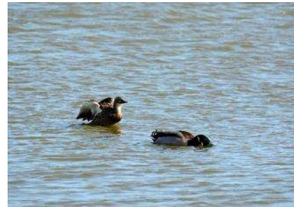
Female & Male Mallard

We would have had some more photos but the birds weren't very cooperative!