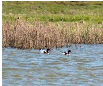
Pair of Shell Ducks