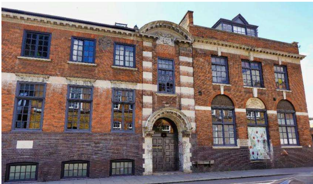
The Mint & Gospel Lighthouse Mission – Shaftesbury Society – 1907

Before our return train journey, some of us ate lunch in the courtyard of The George Inn. The hostelry was familiar to Dickens and features in Little Dorrit.