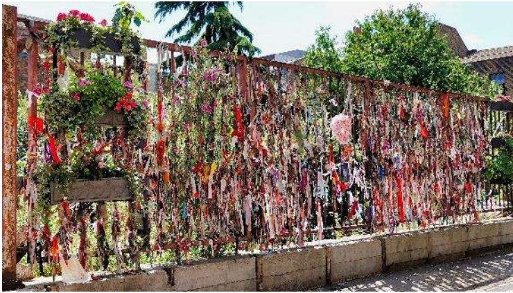
Cross Bones Graveyard